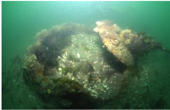
Figure 5 – Picture of the buoy that is marking the approximate position of the stern.