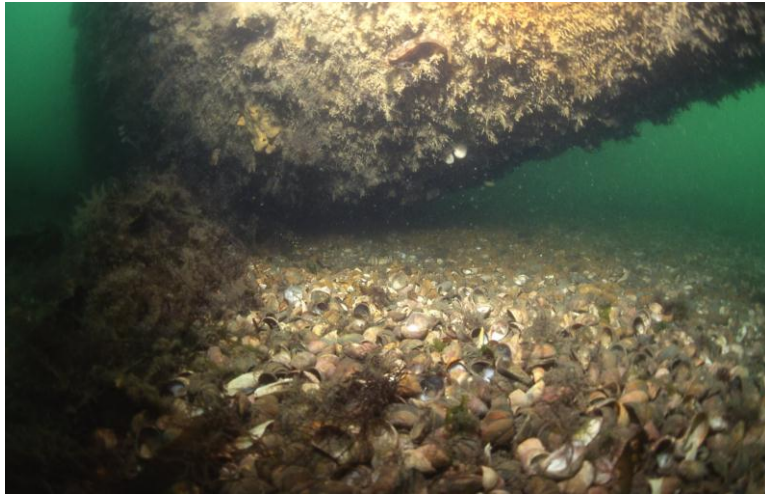
Figure 4 – The bow section of A1 is proud of the seabed.