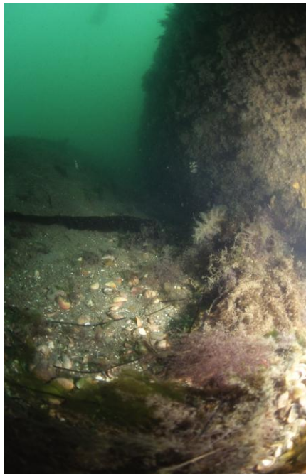
Figure 6 – Looking down the starboard side of A1 showing the scour that has developed.