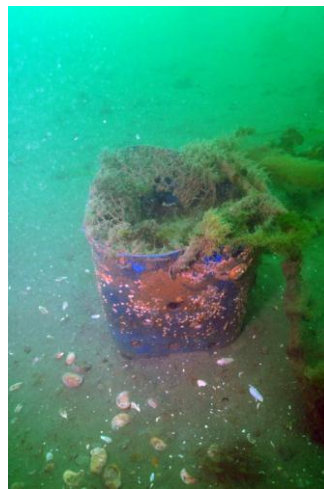
Figure 2 Commercial & homemade lobster pots