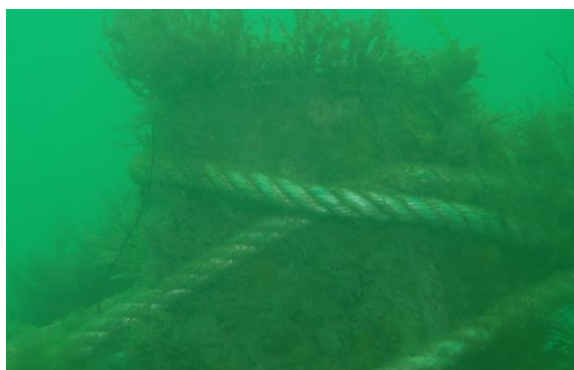
Figure 3 – Some of the rope around the conning tower area

There is a 300m exclusion zone around the wreck site and whilst this is a mandatory limit, it does not take into account movement of pots underwater when strong spring tides are present. Over time, despite being anchored down, these pots have entangled themselves around the wreck.